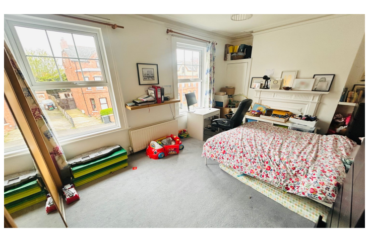
BEDROOM 2: 3.33m (10'11) x 4.37m (14'4)