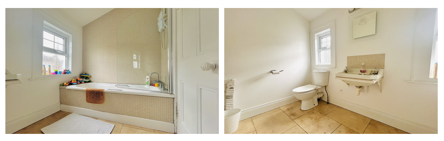
BATHROOM 1: 3m (9'10) x 1.87m (6'2) Tiled flooring, low flush wc, wall mounted sink and panelled bath with electric shower head.